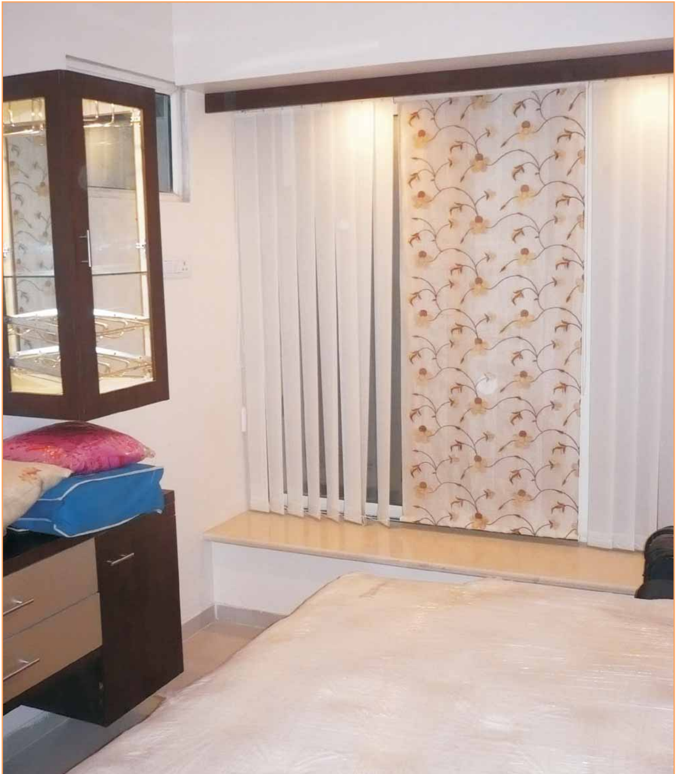
Soft furnishing blinds light fittings