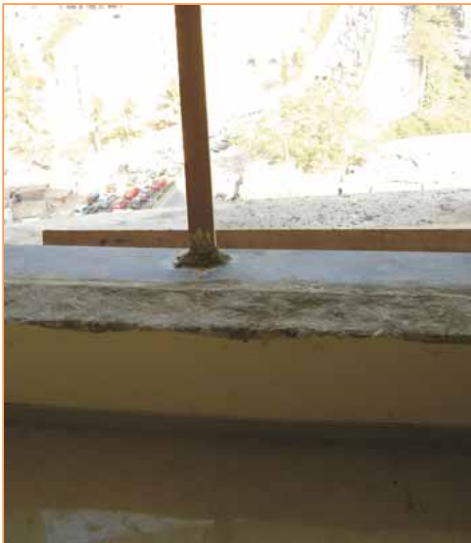
Master bedroom: Window area