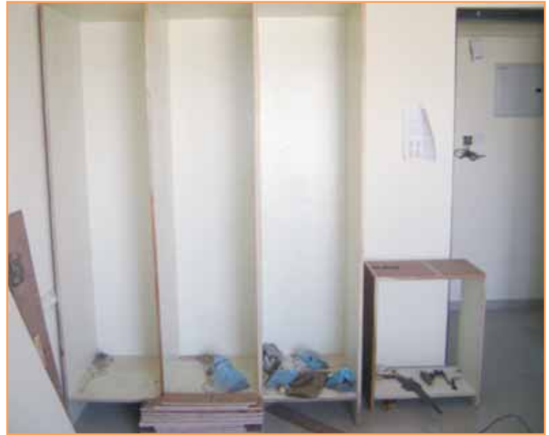
Kid's bedroom: Wardrobe, wood work going on.