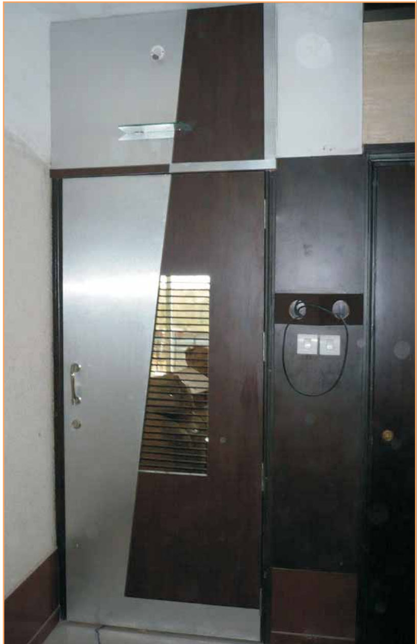
Fitted wardrobes and custom made doors