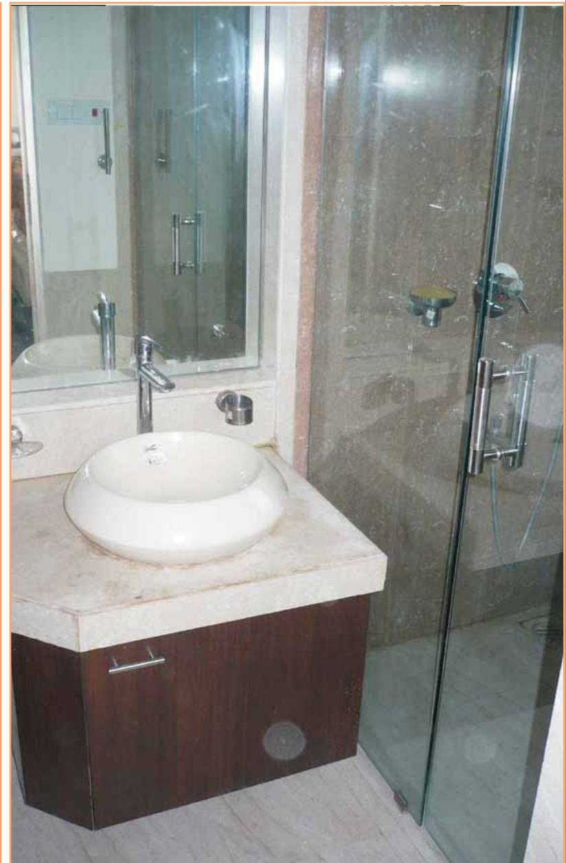
Mirrored bathroom cabinet and shower cubical