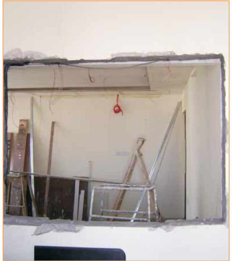
Kitchen area: Way to utility area, door frame has been provided in place of windows. Aluminum sliding door yet to be provided .