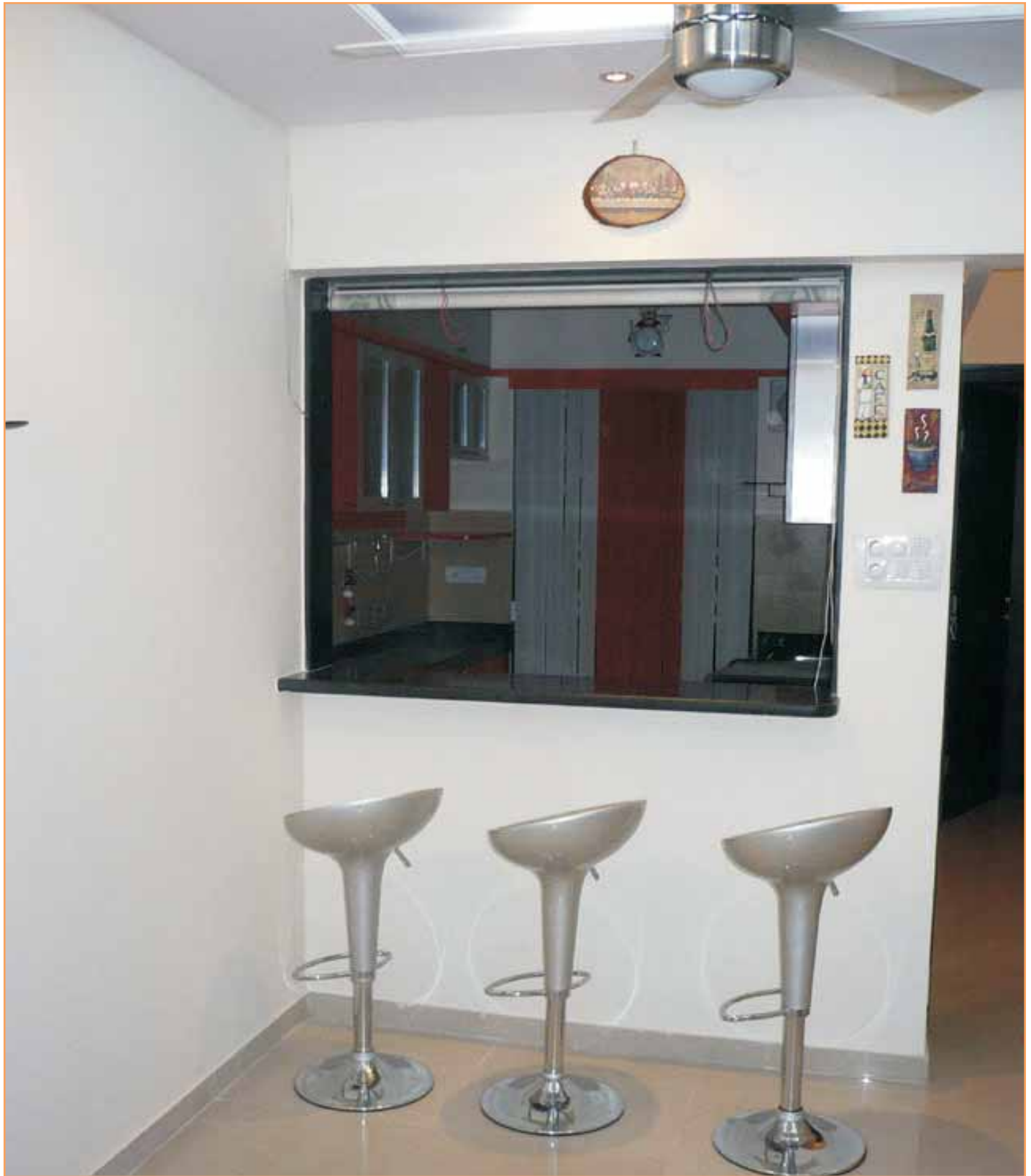
Breakfast counter and service area