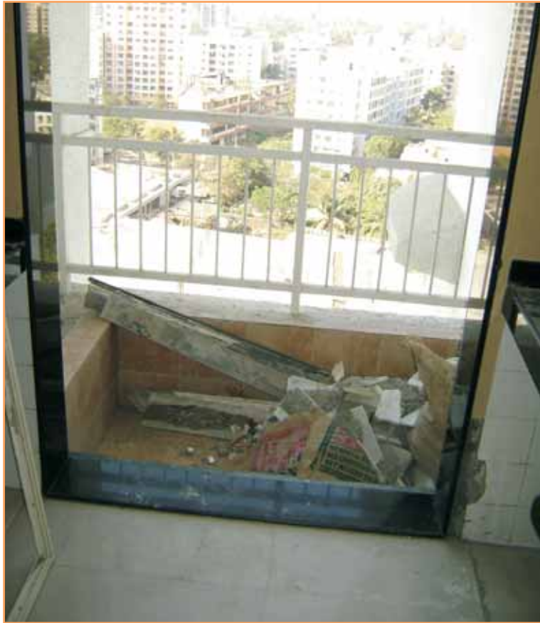
Kitchen area: Service counter. Frame will be fixed around the opening.