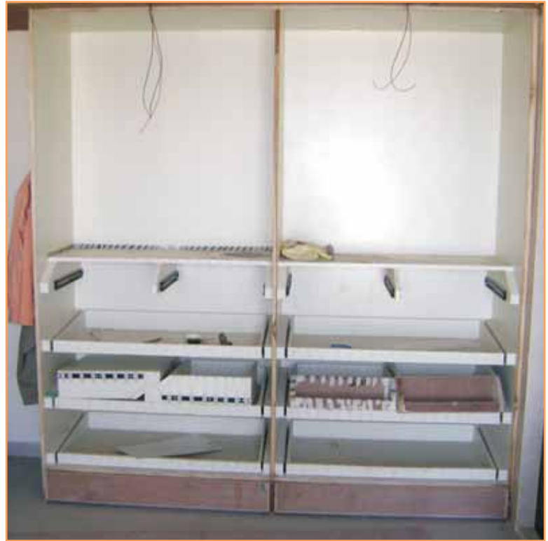
Master bedroom: Wardrobe in laminate finish.