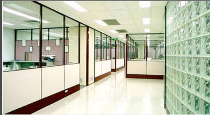
WW Shipping Corp